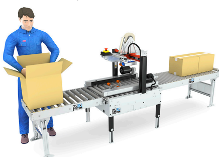
One man pack station