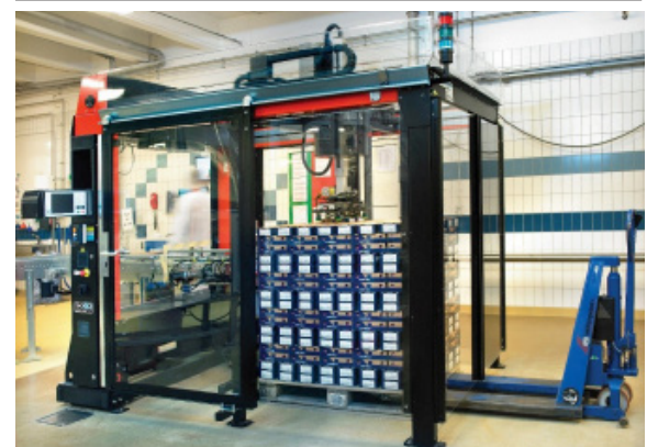
SOCO SYSTEM’s compact palletising robot at Arla Foods in Gjesing Denmark only takes up a bit more space than a single pallet. The touch screen and software ensure first class user-friendliness, which for example makes it quick to calculate new and improved pallet patterns or change existing ones.